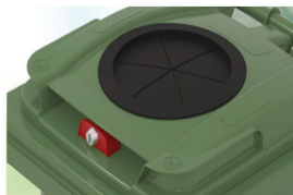
Recycling inserts for waste sorting and gravity lock