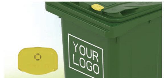
Colored clips, hot stamping, thermo transfer, labeling